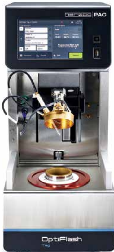
Tag model without stirrer