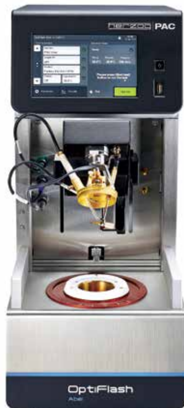
Abel model with stirrer