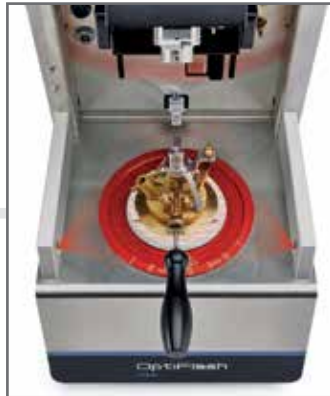
Optical fire detecting system covers entire hot area