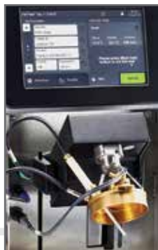
Lift-arm and touch-screen make it easy to operate