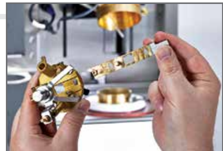
Easy disconnection, for easy and external cleaning of the cup-cover